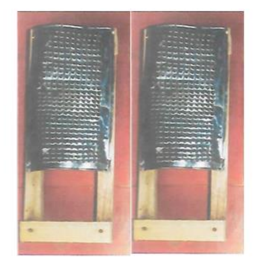
Fig. 4: The perforated plate

Cassava roots: 12 months-old freshly harvested cassava roots of the bitter variety were obtained from a farm of the University of Nangui Abrogoua (Abidjan).