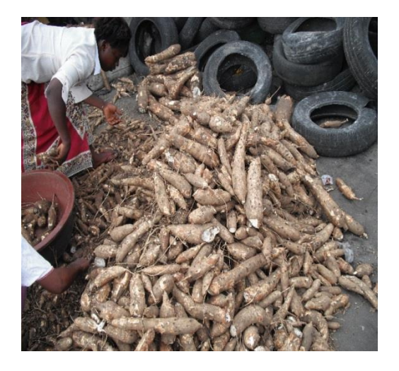
Fig. 1: Cassava roots of the variety IAC