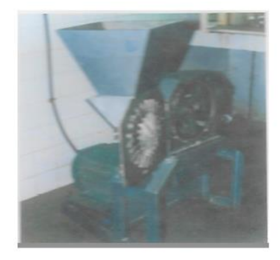
Fig. 3: The power-driven machine