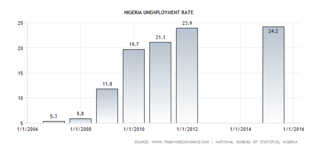
Figure 1: Unemployment Rate Graph

In the Millennium Development Goals (MDGs), eradication of extreme poverty is goal No 1 and the objective was purported to eradicate extreme poverty which failed woefully. The level of unemployment is one